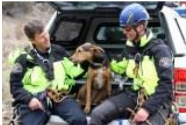
Ralphie the dog with his rescue team after his cliff ordeal.